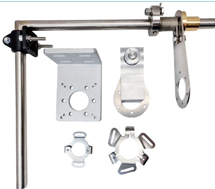
A Photograph Example of our some of our Selections

Below are charts showing a selection of our available fixing options, We also have a selection of options not shown here and can also offer modified versions to suit your individual needs to allow you to replace a competitors model with one of our own.